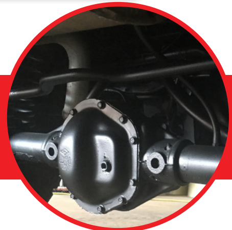
Tectyl® Undercarriage Coatings

Custom high performance coatings and colors for bumpers, vehicles interiors, wheel wells, rocker panels, and more.